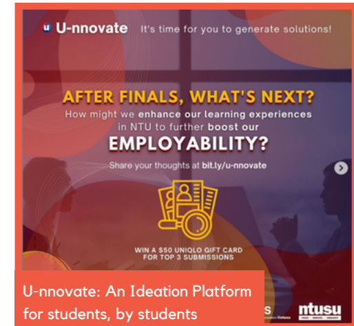
U-nnovate: An Ideation Platform for students, by students