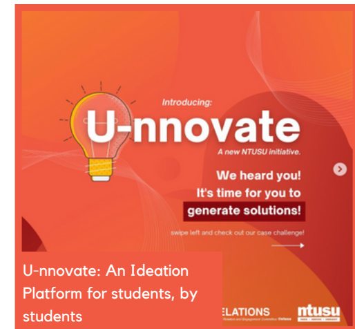
U-nnovate: An Ideation Platform for students, by students